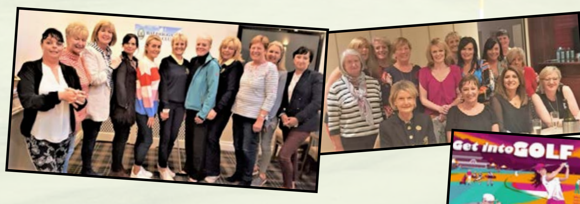
Ladies who have completed the "Get into Golf" programme.

The future for BGC looks bright and the club is making strenuous efforts to attract people to the club and of course to get them to stay. The 'Get into Golf' programme is very successful, due mainly to the wonderful work of the members who volunteer their time.