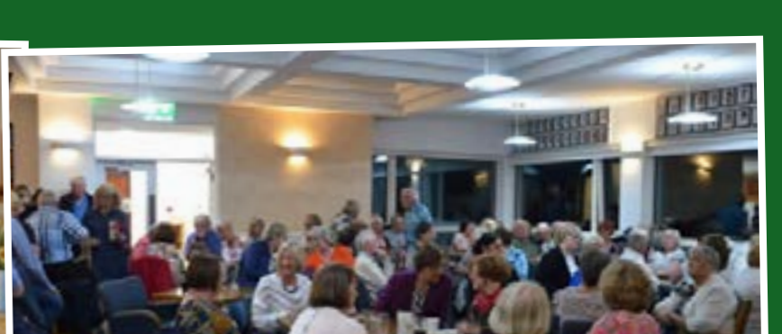
Full house at the Culture Night

We are very grateful to the balbriggan.info website for the use of their photos and text in this storyboard.